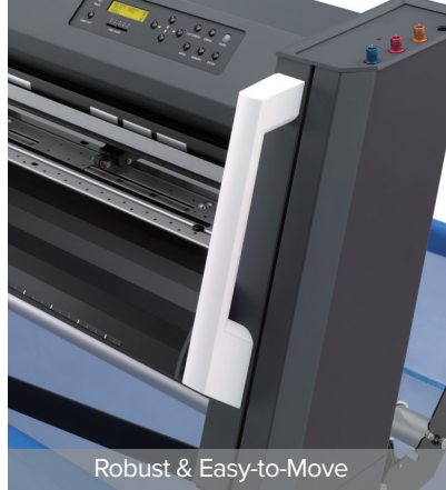
Robust & Easy-to-Move