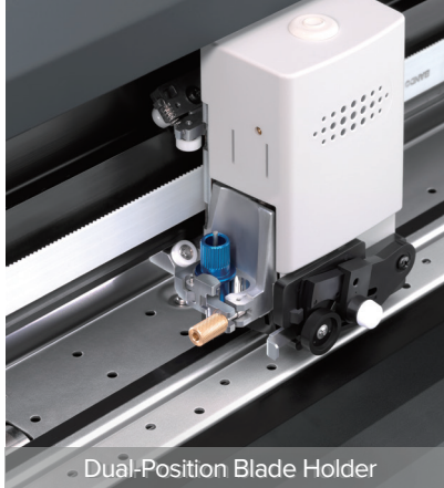
Dual-Position Blade Holder